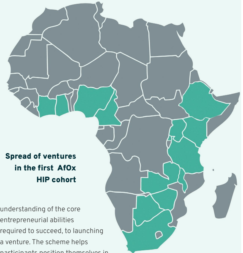
Spread of ventures in the first AfOx HIP cohort

The training aims to equip participants with key skills to successfully navigate their entrepreneurial journey. It provides participants with the skills to go from the development of ideas, through the